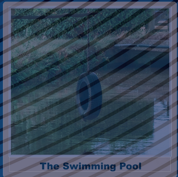
The Swimming Pool